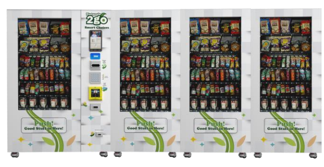
MVP10CP with 3 added MVP10CS

Add up to three (3) Satellite Units MVP10CS