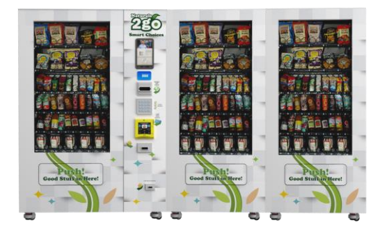
MVP10CP with 2 added MVP10CS

Add up to three (3) Satellite Units MVP10CS