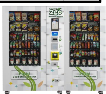
MVP10CP with 1 added MVP10CS